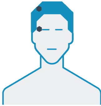
RUL (Right Unilateral)